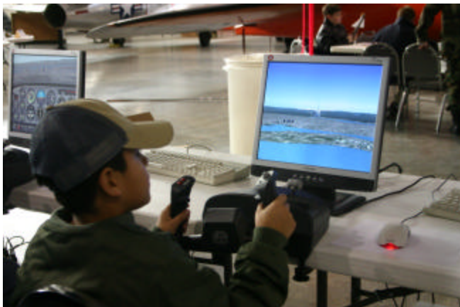
A flight simulator at “Centennial of Flight + 2”