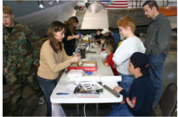
Building rockets at “Centennial of Flight + 2”

Members of the Pueblo chapter helped to support the “Centennial of Flight + 2 on Saturday, December 10. They served as guides for the “Open Cockpit” event. As always the CAP does this volunteer duty the last Saturday of each month. Bring a friend out to the museum and jump into the cockpit of the selected plane on that date. You are sure to enjoy this treasured experience.